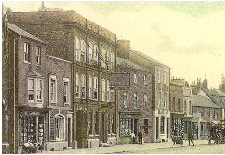
Spread Eagle 1918

May we extend an invitation to everyone who has taken part in the Thame Remembers Project to join our celebration event on 11th November 2018 at 7.45pm. We have booked the banqueting suite at the Spread Eagle, where we will serve up a buffet supper and be entertained by some strolling "Players" who will immerse us in the atmosphere of 1918, interspersed with short speeches, recollections, and mutual congratulations on a job well done.