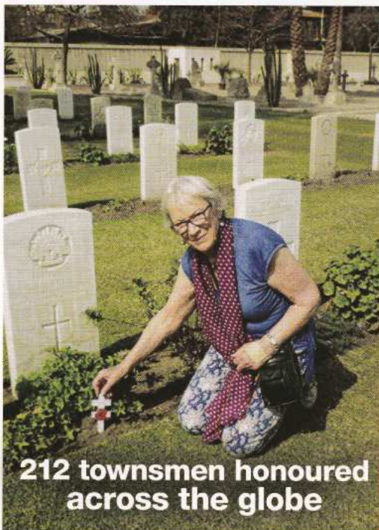
212 townsmen honoured across the globe