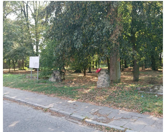
Old German War Cemetery, Nysa

Biddles were able to complete their mission. The cemetery is very overgrown so they placed the wreath by the remnants of the entrance gates. The full story is recounted in our book "Thame Remembers the fallen"