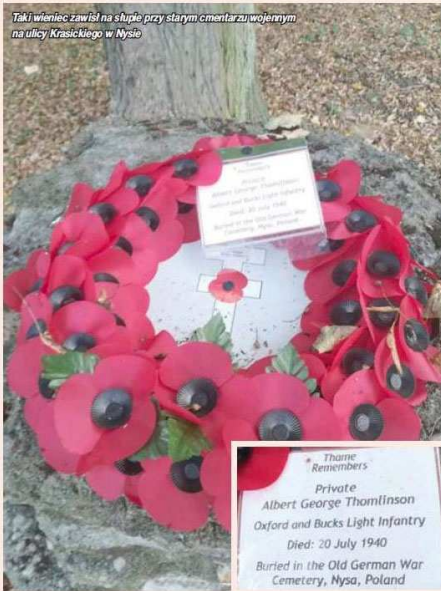
Taki wieniec zawieszono na słupie przy starym cmentarzu wojennym na ulicy Krasickiego w Nysie